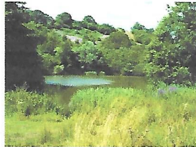
Beautiful riverside views near Hulverton Hill