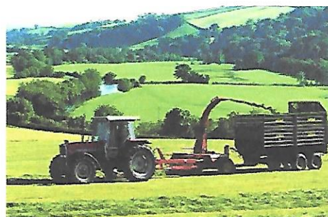
Farming in Mid-Devon

At the end, go through a gate and along the field edge, next to a stream to the Bickleigh Mill complex. Go through the gates to the lane and turn right to continue on the Exe Valley Way.