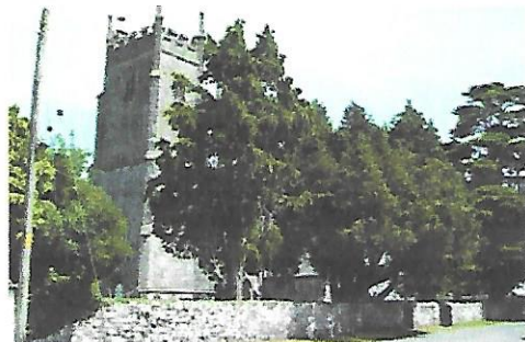
Brampford Speke Church

To continue south, take the footpath opposite the level crossing. At the metal gates go right, partly on, partly alongside, the old Exe Valley railway. Leave this for a footbridge then head for a larger one and turn left to cross the River Exe to Brampford Speke where the direct route is rejoined.